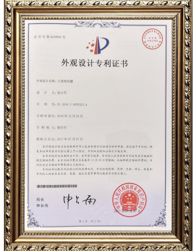
Патентный номер: 201630655323.4