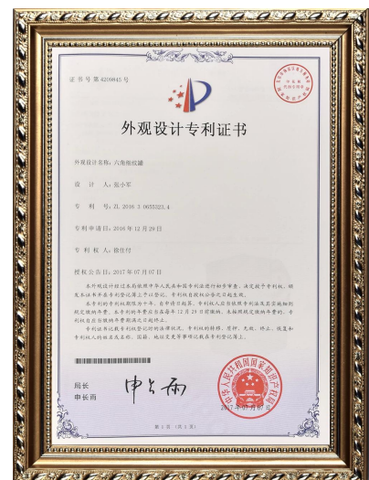
Номер патента: 201630655323.4.