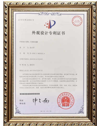
Патентный номер: 20163065523.4