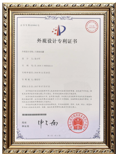
Номер патента: 201630655323.4.