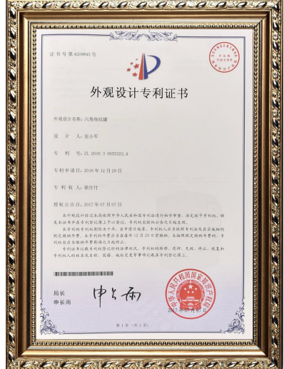
Патентный номер: 20163065532.4