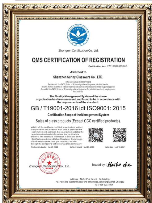
ISO 9001: 2015