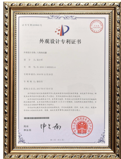
Патентный номер: 20163065532.4