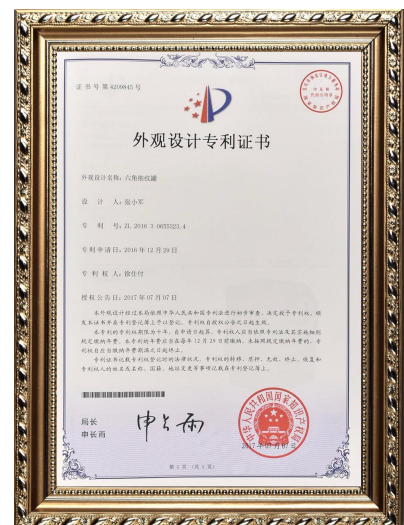
Патентный номер: 201630655323.4