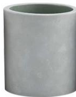
Cement Candle jar