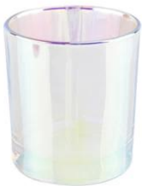
Glass Candle Vessel