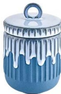
Ceramic Candle jar