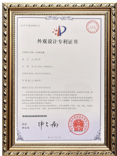
Патентный номер: 20163065523.4