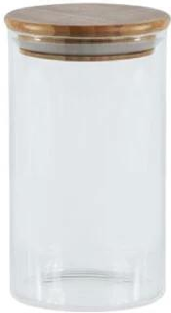
FIGURE 1. A clear glass jar with a wooden lid.