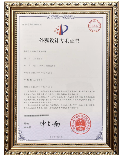
Патентный номер: 201630655323.4