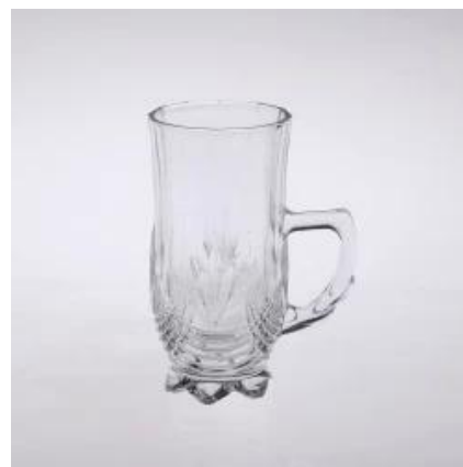
wholesale glass mug