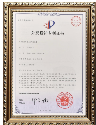
A patente n. : 201.630.655.323,4