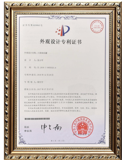
Número da patente: 201630655323.4