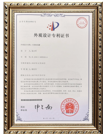
Patente no.: 201630655323.4