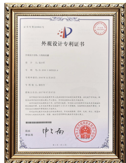
Patente no.: 201630655323.4