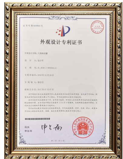
Número de Patente: 201.630.655.323,4