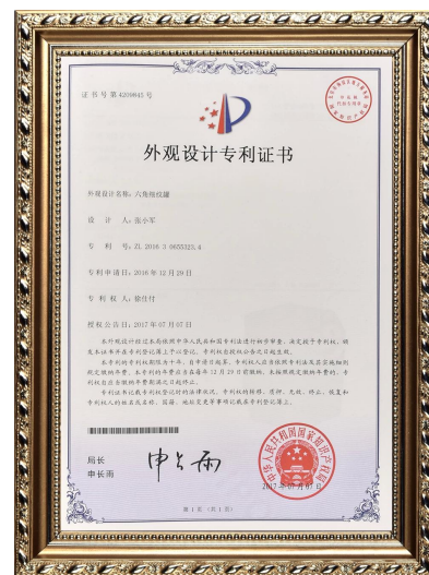
Número da patente: 201630655323.4