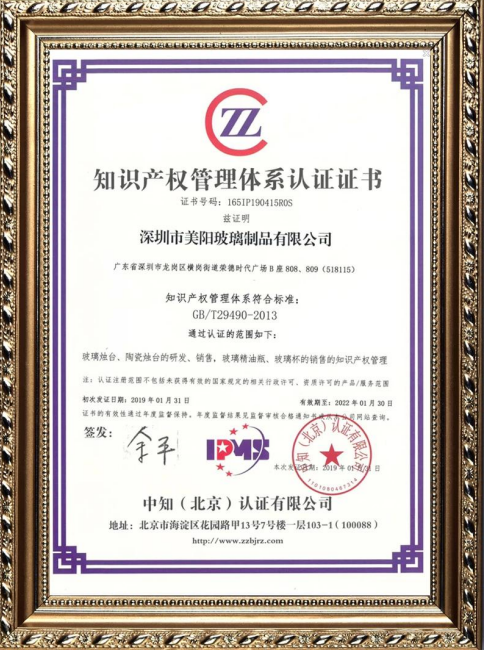
Enterprise intellectual property