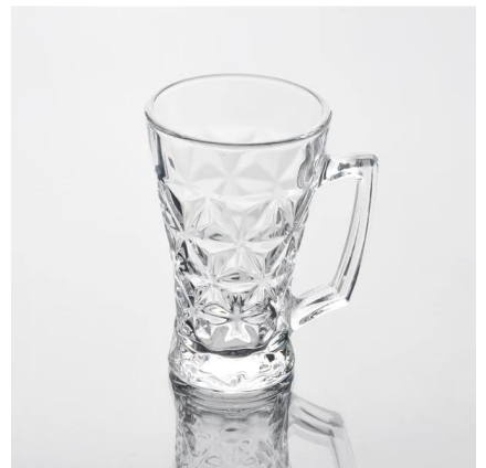
wholesale glass mug