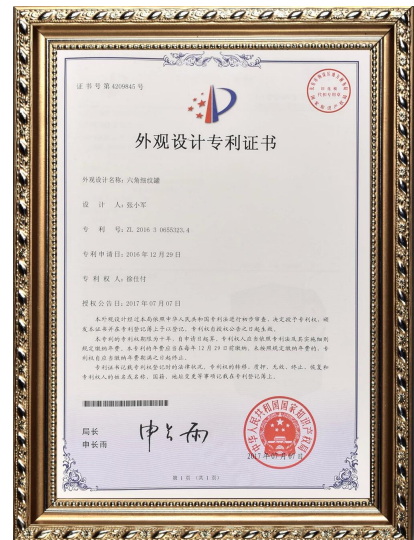
Patente n.º: 201630655323.4