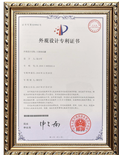
No. patente: 201630655323.4.