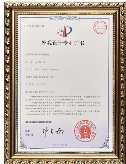
Patente no.: 201630655323.4