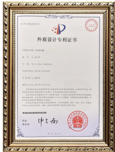
Número da patente: 201630655323.4