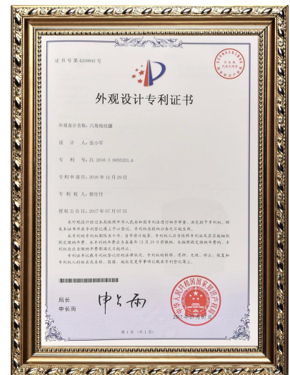
Número de patente: 201630655323.4