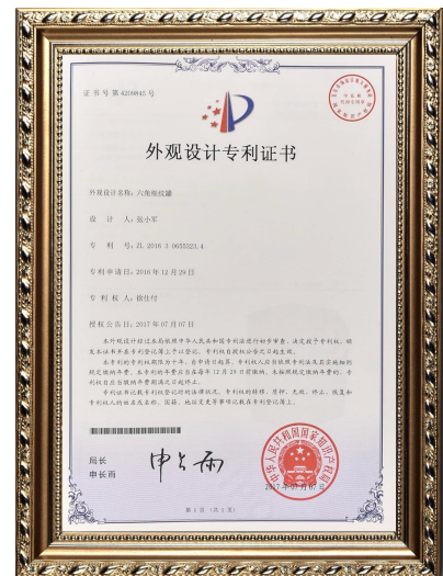
Patente no.: 20163065523.4