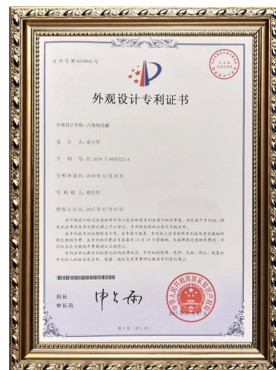
Número da patente: 201630655323.4