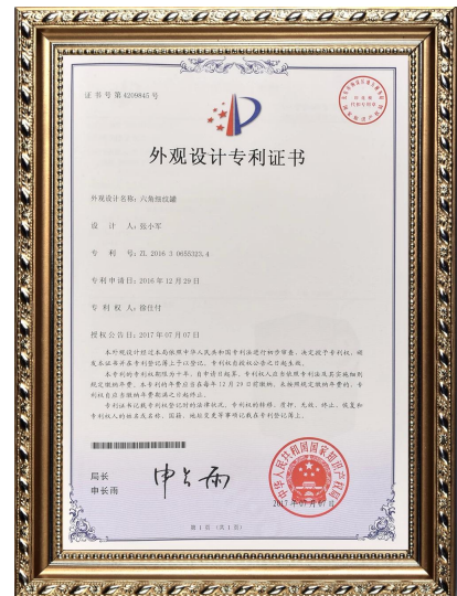
Patente no .: 201630655323.4