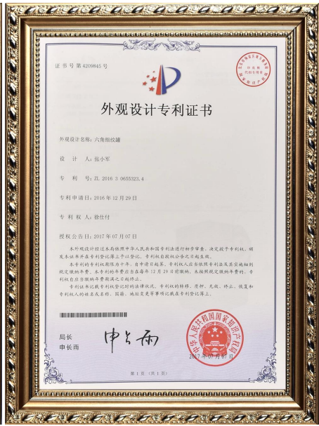
Número da patente: 201630655323.4