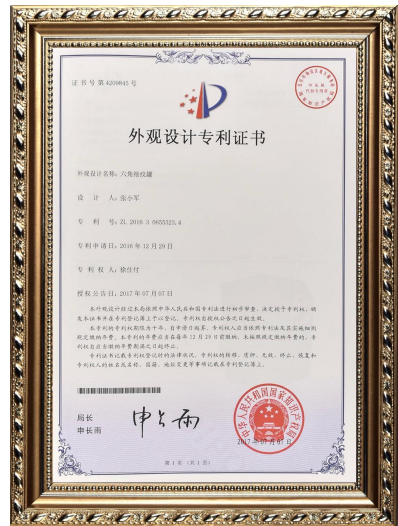
Número da patente: 20163065532.4