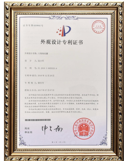
Número da patente: 201630655323.4