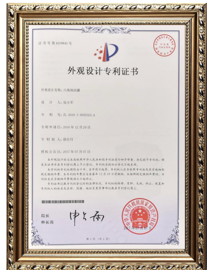
Patente n.º: 2016630655323.4