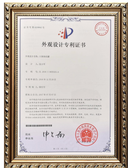
Patente n.º: 201630655323.4