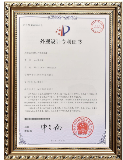
Número da patente: 201630655323.4