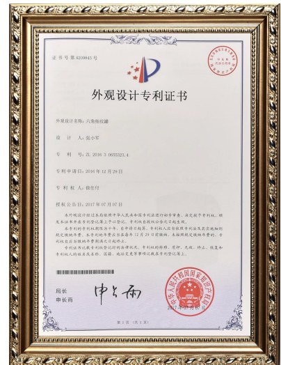
Número da patente: 201630655323.4