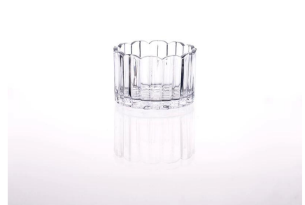
clear candlestick glass