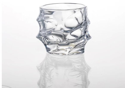
decoration glass candle holder