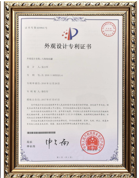
Número da patente: 20163065323.4