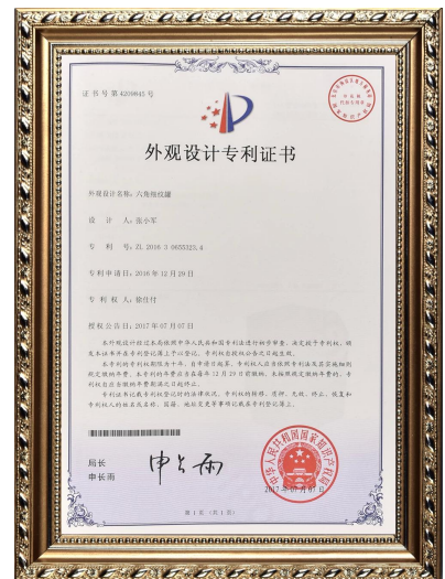
Número de patente: 201630655323.4