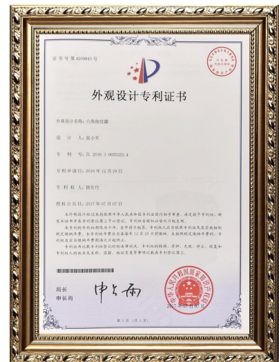
Patente no.: 201630655323.4