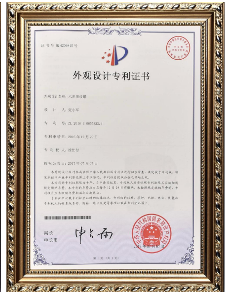
Patent Number: 201630655323.4