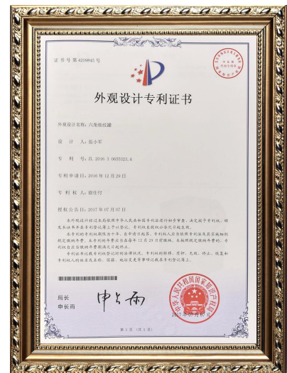
Patente no.: 20163065523.4