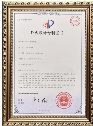
Número da patente: 201630655323.4