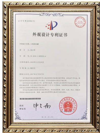
Número da patente: 201630655323.4