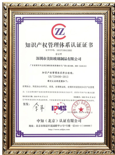
Empresa de propriedade intelectual