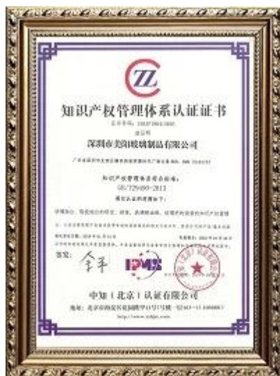
Corporate intellectual property