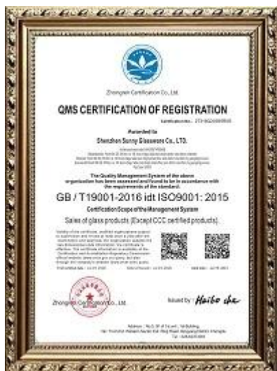
ISO 9001: 2015