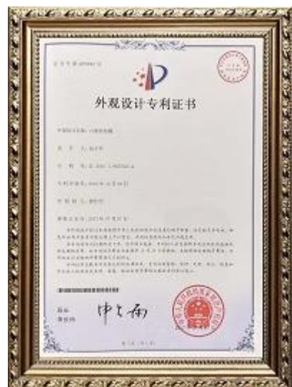
Patent no.: 201630655323.4