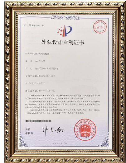
Patent no.: 201630655323.4