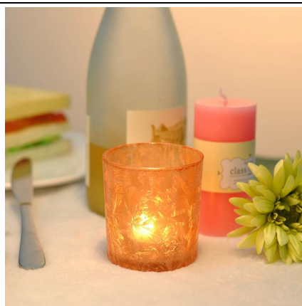
Frosted Glass Votive Candle Holders