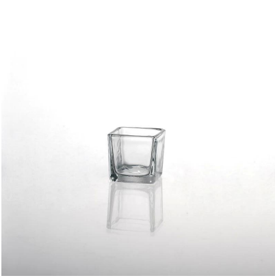
square clear glass candle holder