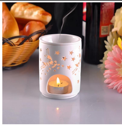
hollow design ceramic vigil lamp candle holder